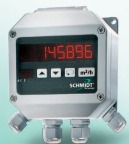
LED display MD 10.010/015 in wall housing